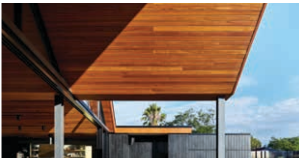
Timberland - Lining Blackbutt