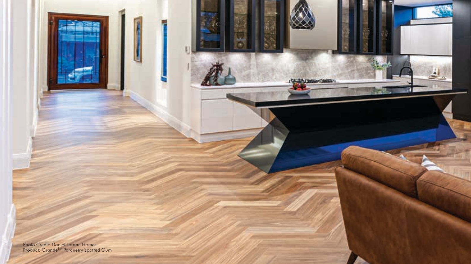
Product: Grande™ Parquetry Spotted Gum