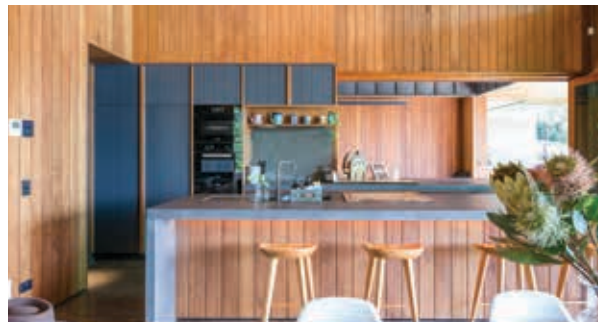
Tallebudgera Creek - Shiplap Cladding Blackbutt