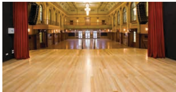
Hawthorn Town Hall - Solid Strip Flooring Blackbutt