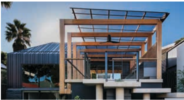
St Peter's Cottage - F27 Blackbutt